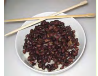
Black Beans over Rice

Add ingredients to saucepan and bring to boil. Simmer for 10 minutes, stirring periodically.